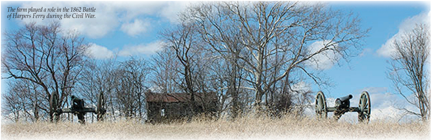
The farm played a role in the 1862 Battle of Harpers Ferry during the Civil War.