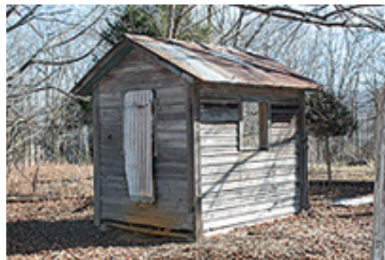
Remaining outbuildings give a view of life in a company town associated with the Standard Lime and Stone Company .