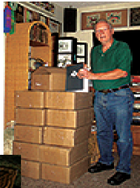
The books arrived and 77 books were shipped in October 2019.