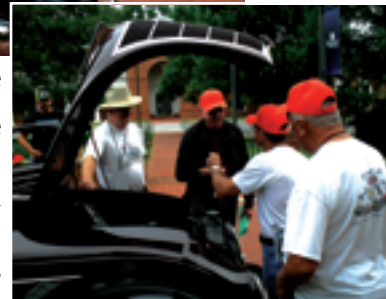
I assumed chief photographer duties at the Airflow Meet, what a great time with these old classics.