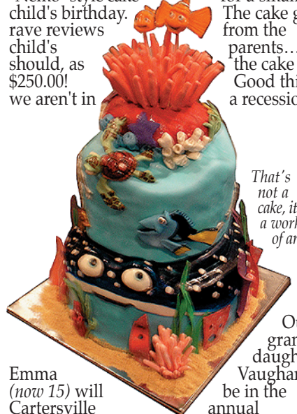
That's not a cake, it's a work of art!

for a small child's birthday. The cake got rave reviews from the parents...it should, as the cake cost $250.00! Good thing we aren't in a recession!