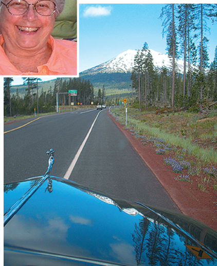
That's Mount Bachelor near Bend, OR, while a passenger in a '36 DeSoto Airflow