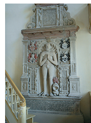
The church at Raboldshausen... birth town of Johann Caspar Altstadt in 1673 is a tour destination.