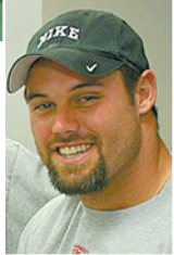
St. Petersburg Tribune