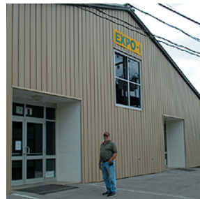
Jeff Williams led a tour of the Clearfield Fairgrounds facilities. Top: Expo 1 building where most events will take place. Below: The Open Pavillion near the wooded RV sites.

Each year, during the Labor Day weekend, over 100 members of this part of the clan usually get together for gabbing and delicious pot luck at Marcus Park near Clearfield. "Over the AAA Reunion...continued on page 3