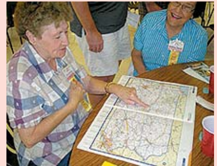
Clearfield...it's right in the heartland of the great state of Pennsylvania.

Labor Day Weekend September 2014 Clearfield, Pennsylvania Start making your plans now to attend! More information to follow in next years AAA Newsletter