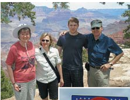
Above: at Grand Canyon, right: Steak House in Norfolk, NE