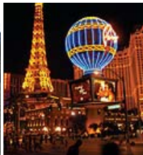
Left: Universal's Blues Brothers, above: Las Vegas Lights