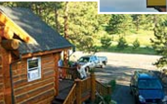
Left: JB's log house in the Colorado mountains