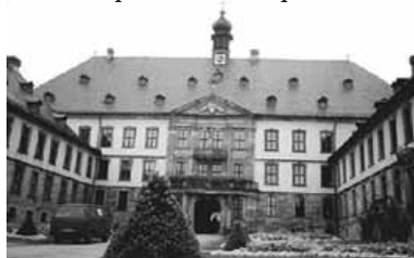
Beautiful Castles, Palaces and Cathedrals await your viewing pleasure as we tour the heart of Germany

and I liked was the NordSee Seafood Restaurant. The food was very good served cafeteria style. They had everything from fish and chips at €2.99, to salads from €5.80 to €6.50, to full meals from €7.50. Our walking route in Paderborn and Bad Hersfeld carries us by NordSee Restaurants.