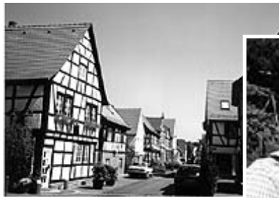
Main street of Dreieichenhain Germany