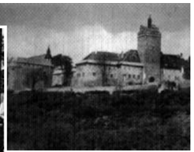
Allstedt Castle in Saxony Anhalt