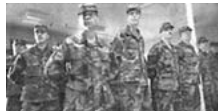
Members of the Army's 19th Corps Materiel Management reserve unit listen solemnly to the charge for deployment in the Bosnian peacekeeping effort.

He just didn't expect to hear about it from a radio reporter.